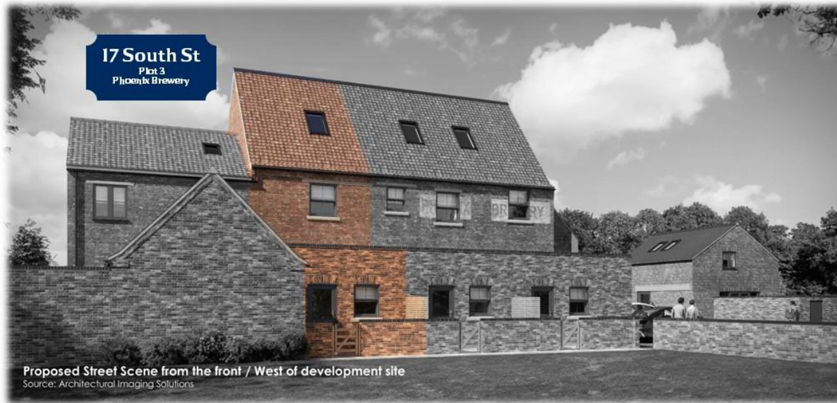
AF Architecture - c/o Fremont Developments Ltd. Land and buildings to the east of Hamerton Gardens, South Street, Horncastle, Lincolnshire LN9 6DT