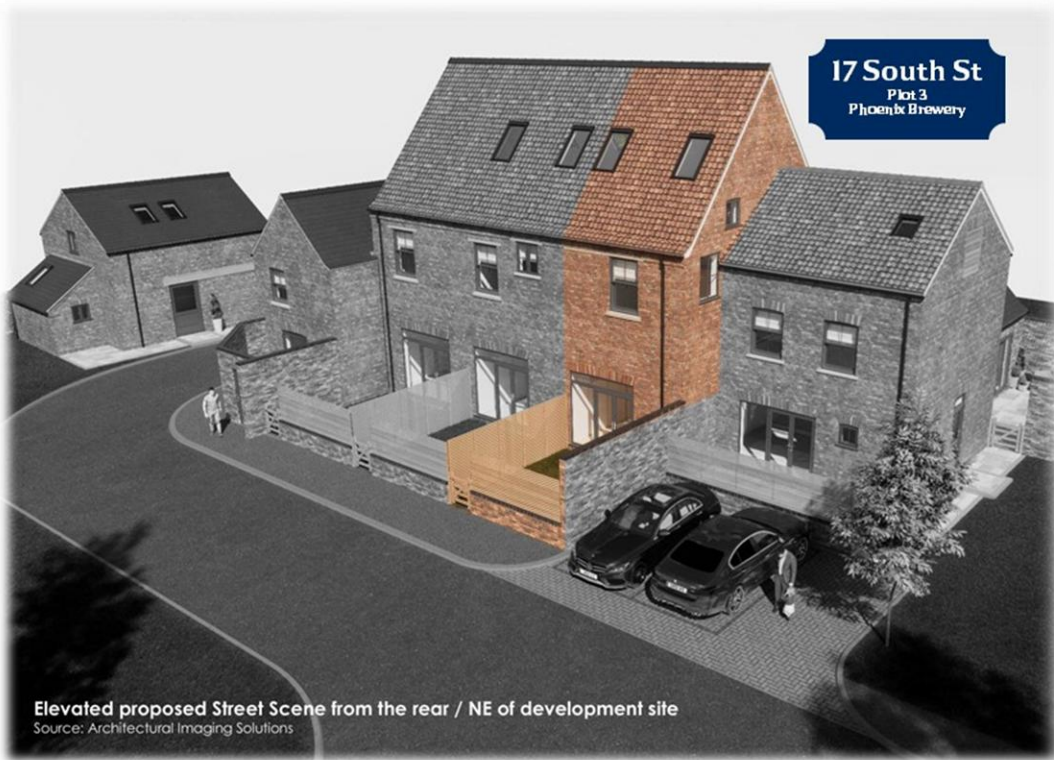
Elevated proposed Street Scene from the rear / NE of development site

AF Architecture - c/o Fremont Developments Ltd. Land and buildings to the east of Hamerton Gardens, South Street, Horncastle, Lincolnshire LN9 6DT