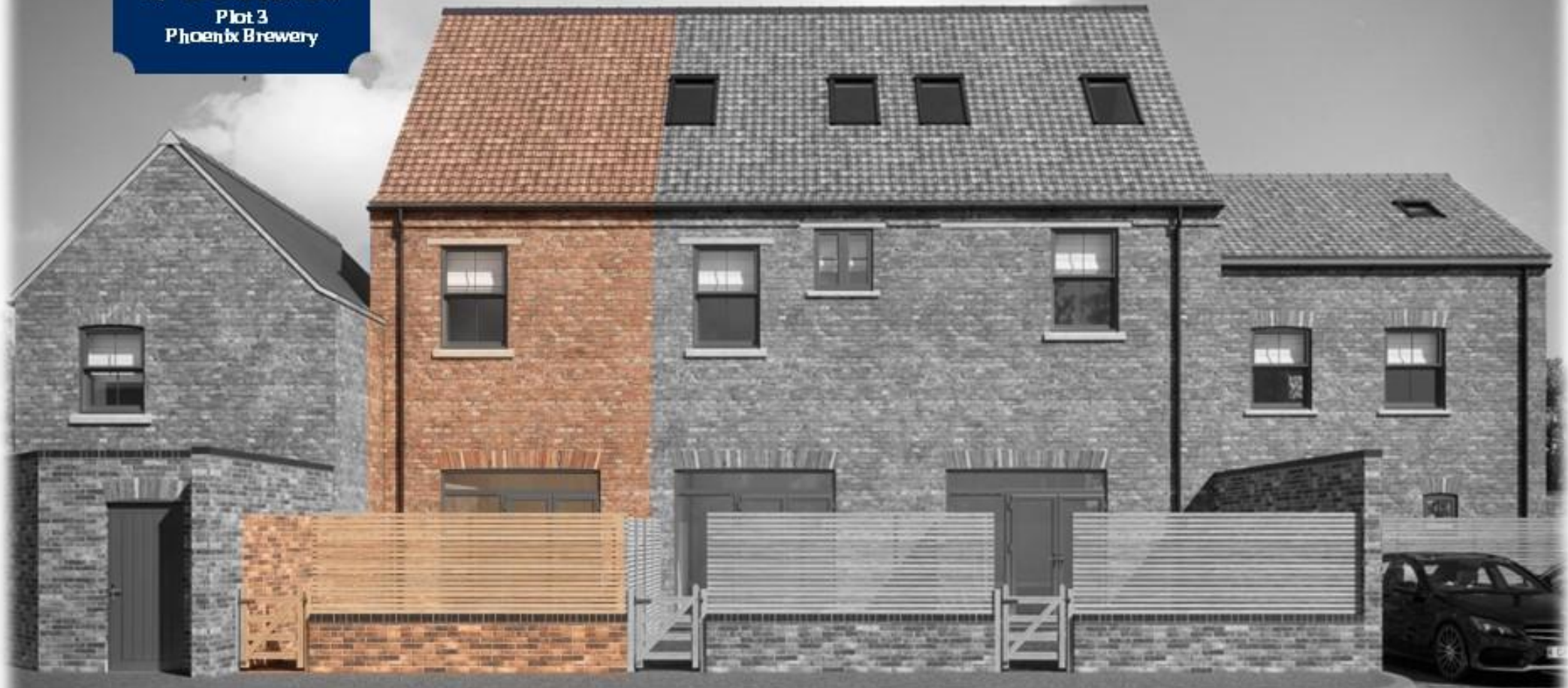
Proposed view of Buildings 1 & 2 (plots 1-5) taken from the rear / East